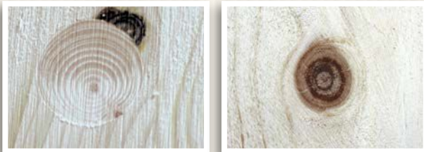
Conventional natural knothole patch vita natural knothole patch

Selected timbers in spruce and douglas fir make the panels beautifully shaped unique pieces. The panel surface is perfected with high-quality elka natural knothole patches .